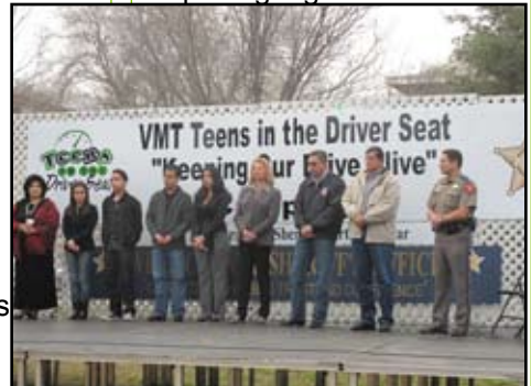
Vidal M. Trevino School of Communications and Fine Arts hosted a "Keeping Our Drive Alive" campaign.

accident and working with the fire department and other local community members to help create a PSA for safe teen-driving awareness. They are also starting to plan the events for their spring safety campaign, which will include a buckle-up day and other days designated specifically for each risk factor.