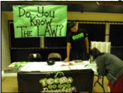
Irvin High School hosted a TDS table display during a basketball game.