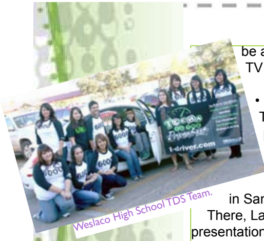
Weslaco High School TDS Team.