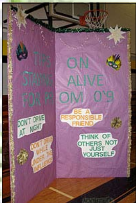
Gatesville High School held a safe-driving day in preparation for their prom.