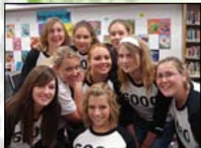
The Littlefield High School TDS team has been very active with their program.