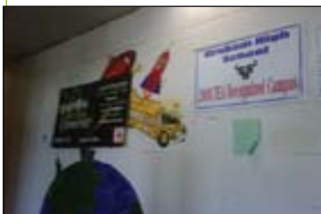
Teens in the Driver Seat banner at Graham High School.