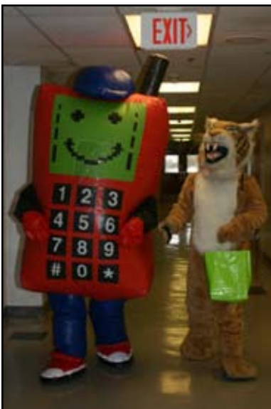
Big Distraction and the Archer City High School mascot helped spread the message at the teen safe driving day.

Archer City High School, in Archer City, Texas, held a teen safe-driving day on March 11, to help spread the word about how to improve teen driving safety. The day included videos, speeches, and a mock car crash.