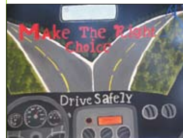
Poster from the Coronado HS safe-driving poster contest.