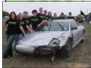
This wrecked car at La Vernia High School was part of their driving safety week.