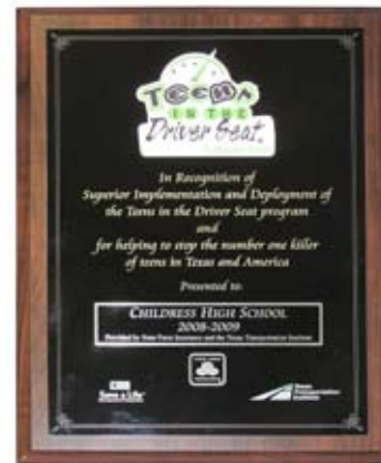
TDS Outstanding Schools received plaques for their hard work and dedication in fighting the number-one killer of teens in America.