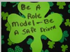
In March, Connally HS made a "Be Lucky with Your Life" board with brightly colored "safety" shamrocks on display, courtesy of the TDS student group.