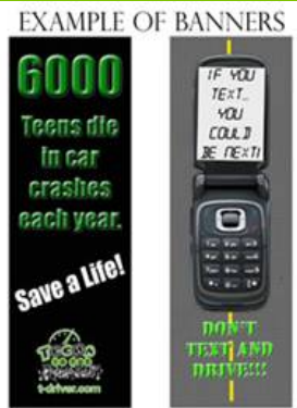
Making use of the latest technology, Jacksboro HS has developed four different TDS banners