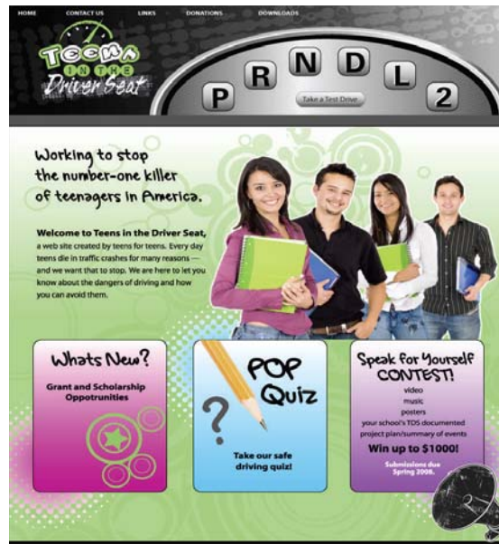
(Above) TDS t-driver.com home page has a colorful, eye-catching new look with new features to go with it.

Enhancements to the site that visitors can expect to see and utilize are an easier and more colorful navigation menu, TDS radio and television public service announcements, a slide show featuring